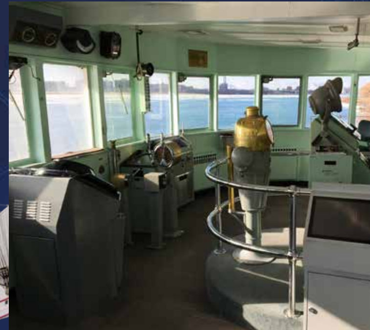
Acquiring the pilothouse of the S.S. William Clay Ford was a project of the Great Lakes Maritime Institute