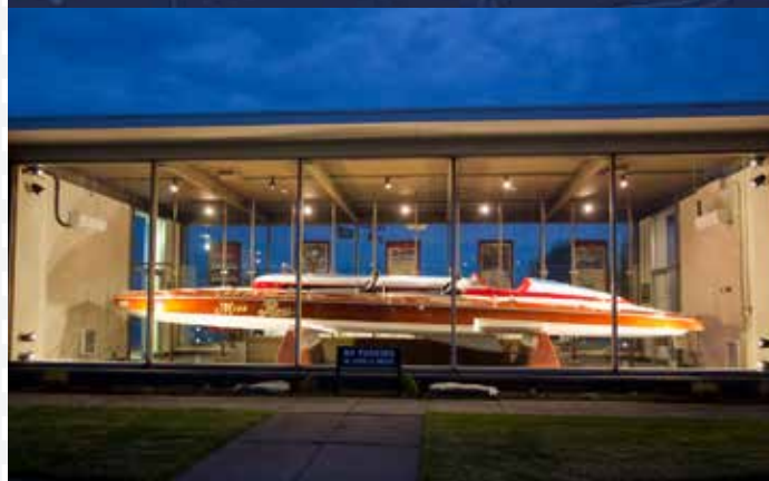
The GLMI assisted in acquisition of the historic hydroplane racing boat, Miss Pepsi . She is now on permanent display at the Dossin Great Lakes Museum