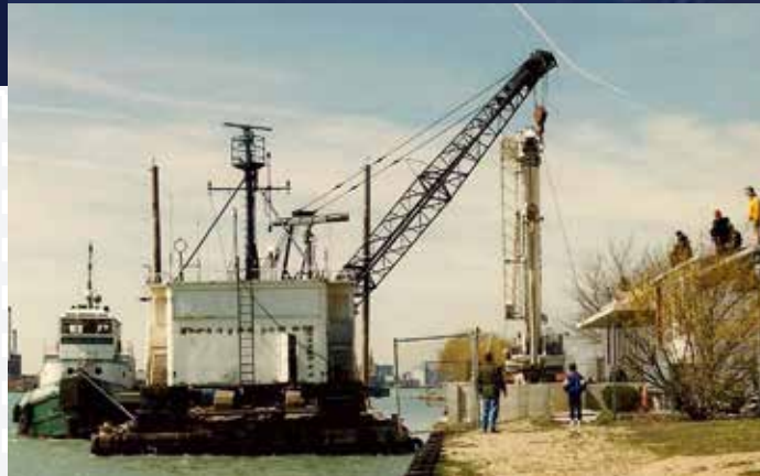
The GLMI assisted in acquiring and installing of the S.S. William Clay Ford pilot house, now a permanent fixture of the Dossin Great Lakes Museum.