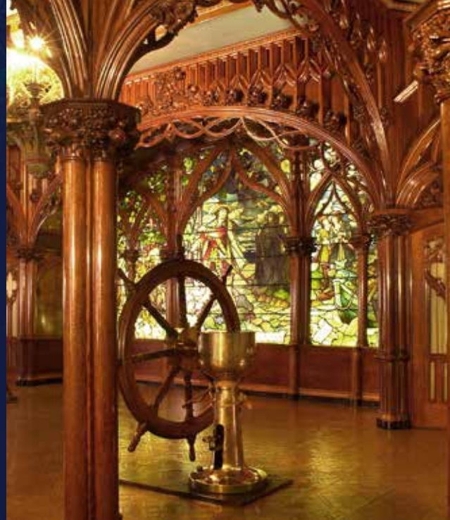
Gothic Room from the sidewheel steamer S.S. City of Detroit III .

Cover Photos: Recovered anchor from S.S. Edmund Fitzgerald on permanent display at the Dossin Great Lakes Museum; One of six cannons recovered from the Detroit River.